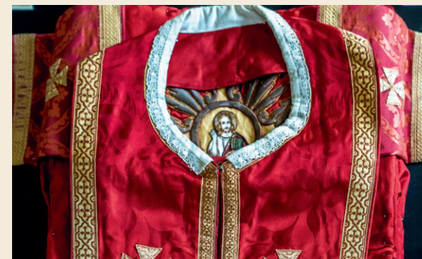
Photo: Presbyteral Vestment worn by Blessed Paul Gojdich on display at the Chancery of the Eparchy of Parma.